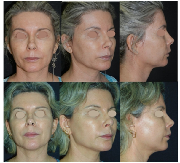
(Figure 3. 54-year-old female, 90 days after the first BioSculpt® session.)