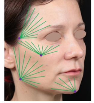
(Figure 2 - Entry points and feedback lines)

Up to ten injection lines are drawn in a fan-like fashion, converging to the entry point.